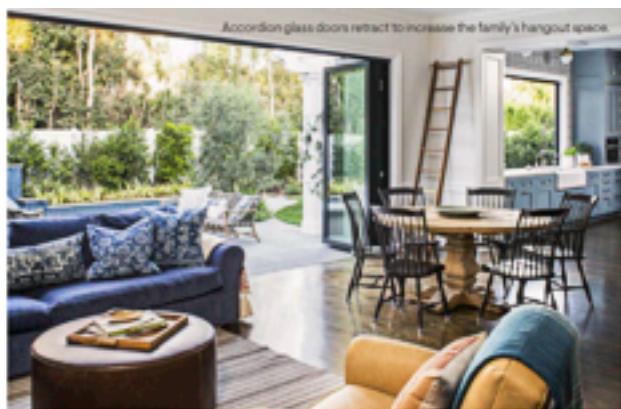
Accordion glass doors retract to increase the family's hangout space.