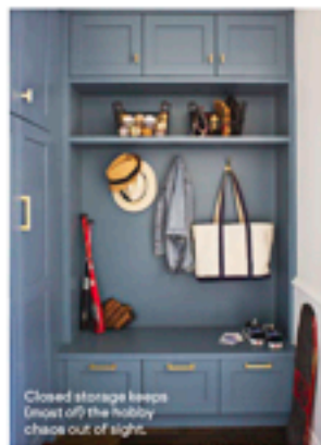
Closed storage keeps most of the hobby chase out of sight.