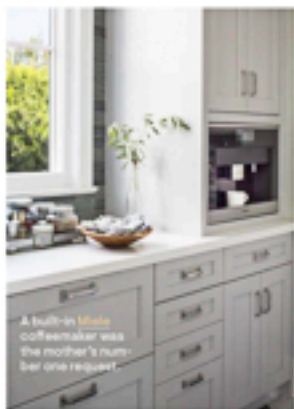
A built-in Breville coffee maker was the mother's number one request.

W HEN, AFTER NEARLY a decade of slowly renovating the rest of their home, a Pacific Palisades, California, family of seven finally