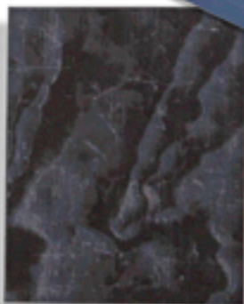
Liquid Embers , from $58 per sq. ft. deklon.com