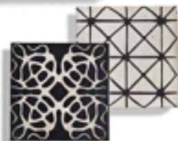
Sound Wave by Foresti Lesci-Midleton, $24 per tile. ifinceramics.com