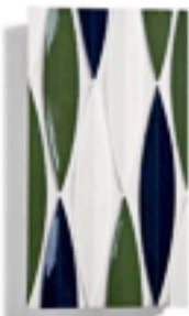
Designed to emulate canoees. Keel Coastline Blend , $48 per sq. ft. karekobbytile.com