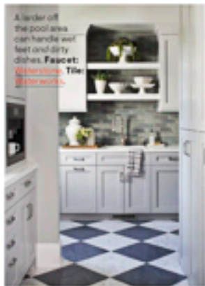
A ladder off the pool area can handle wet feet and dirty dishes. Faucet: Waterstone. Tile: Waterworks.