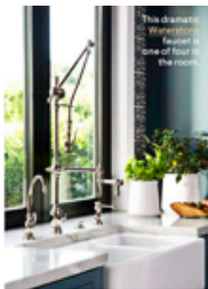
This dramatic Waterstone faucet is one of four in the room.