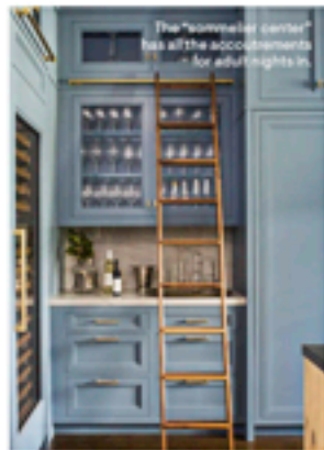
The "summer center" has all the accoutrements for adult nights in.

Practicality is key, but plenty of attention was paid to showstopping color and patterns. It didn't take much convincing to get the clients on board with the tranquil blue palette from Rideau's Frida line of cabinetry, but the tile was a different story. "They loved it, but wanted to use it in a 'little way,' like on a pantry floor," she says. Instead, she took it from countertop to ceiling. Rideau's mantra is, "If you love it, you should see it!" And now, the kitchen feels as joyous as its inhabitants.