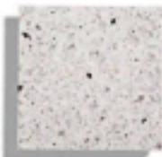
Extra-large terrazzo quartz. Karekare , from $65 per sq. ft. wilsonart.com