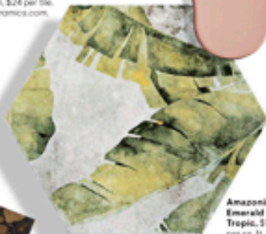
Amazonia Emerald Tropic , $13 per sq. ft. tilefogs.com