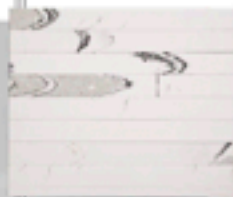
Fabricated from cut pieces of quartz to mimic butcher block. Brittanica Block , from $120 per sq. ft. combriusa.com

You can do better than subway tile. Read: detailed mosaics, graphic tiles, or full-surface slabs.