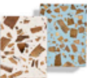
Composite of woods cast in a non-VOC resin. Foresco Timber Terrazzo , from $65 per sq. ft. 4pgd.com