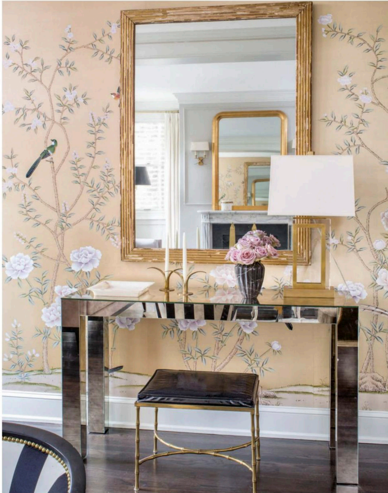
In the entry of designer Wendy Labrum's Chicago home, the walls are covered with hand-painted silk wallpaper from de Gournay in New York. A vintage French stool from Modern Drama pulls up to a mirrored console designed by Labrum. The vintage French mirror is from Jayson Home and the lamp is from Circa Lighting.