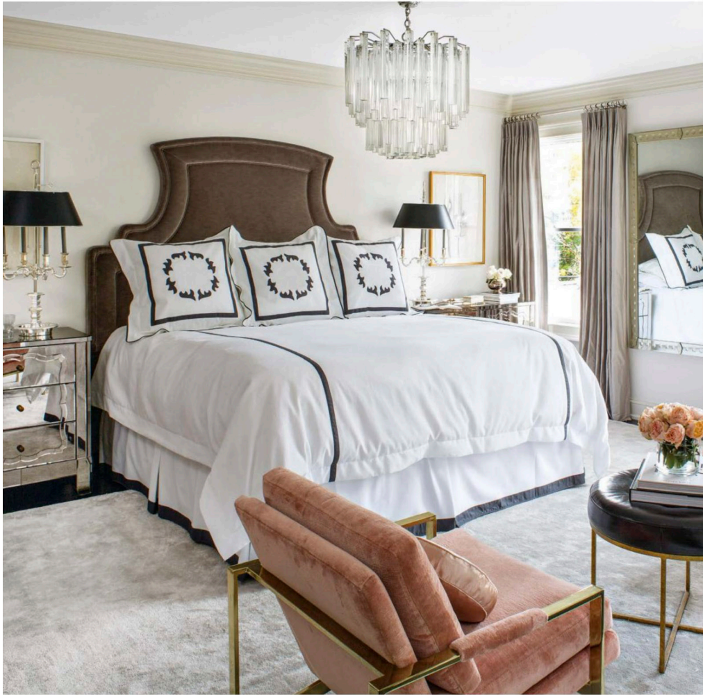
A bed designed by Labrum is swathed in Great Plains linen-velvet from Holly Hunt and covered with bedding by Leontine Linens in the master bedroom. Antique mirrored dressers from Bungalow 5 in New York and a vintage Venini chandelier, purchased through 1stciobis, lend elegance.